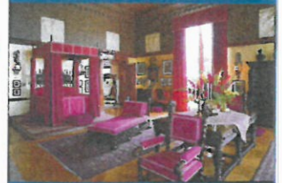
Grand Victorian architecture.