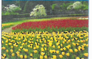
One of the Biltmore's many gardens.

Departure: Farmers & Merchants Bank, 905 Plaza Drive, Saint Clair, MO @ 8 am, then Farmers & Merchants Bank, 1010 Crossroads Pl, High Ridge, MO @ 9 am