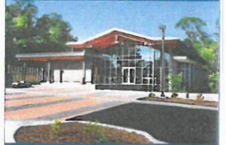
The Blue Ridge Parkway Visitor Center.