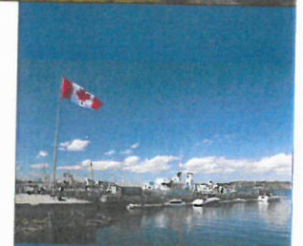
Enjoy a visit to historic Halifax

Cancellation insurance is not included in price but highly recommended. Insurance must be purchased directly from Travel Insured International