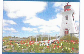
Visit to picturesque Prince Edward Island