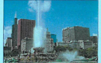
Guided Tour of Chicago

Day 5: Today after enjoying a Continental Breakfast, you depart for home... A perfect time to chat with your friends about all the fun things you've done, the great sights you've seen and where your next group trip will take you!