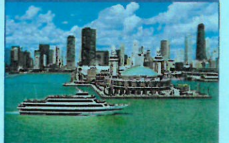
Enjoy a Skyline Cruise on Lake Michigan